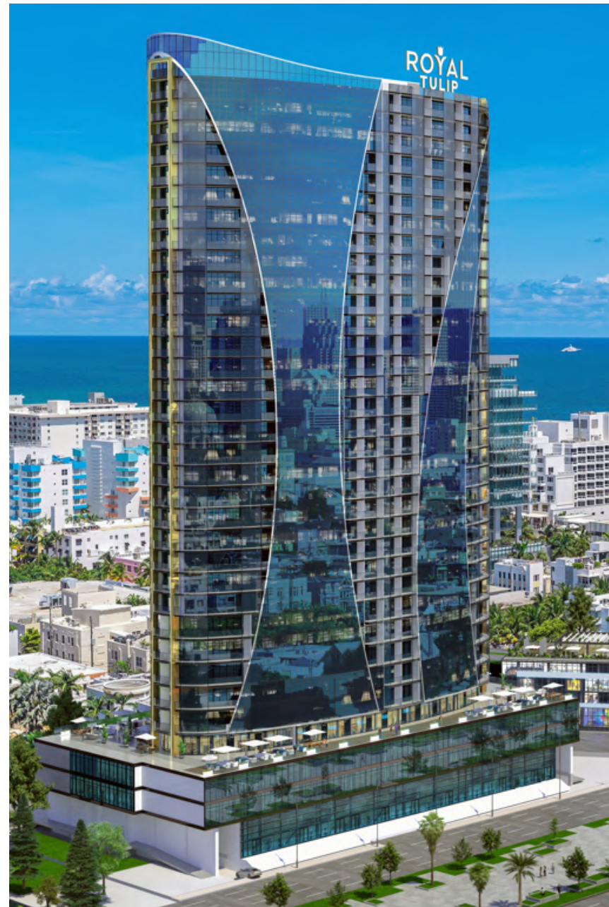
◆ Investment Complexes Batumi