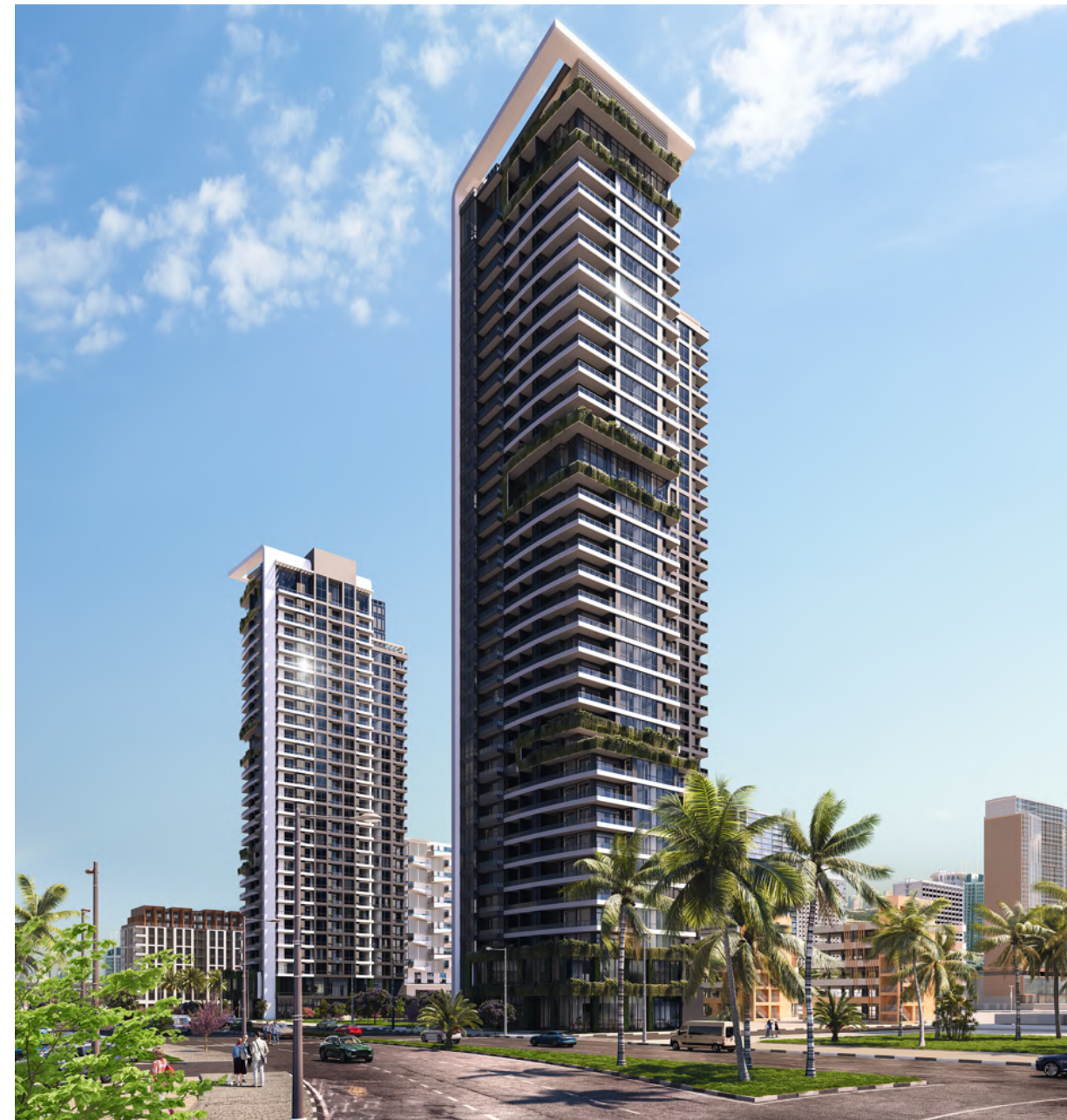
◆ Residential Complexes Tbilisi